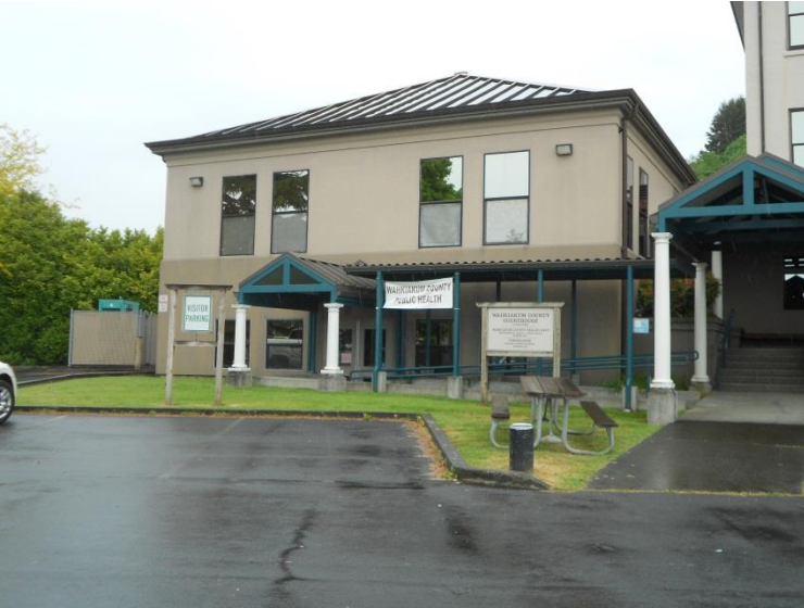
Wahkiakum Health Department, located behind the court house