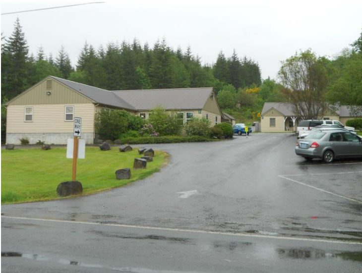
Wahkiakum Human Services campus on Elochoman Valley Rd