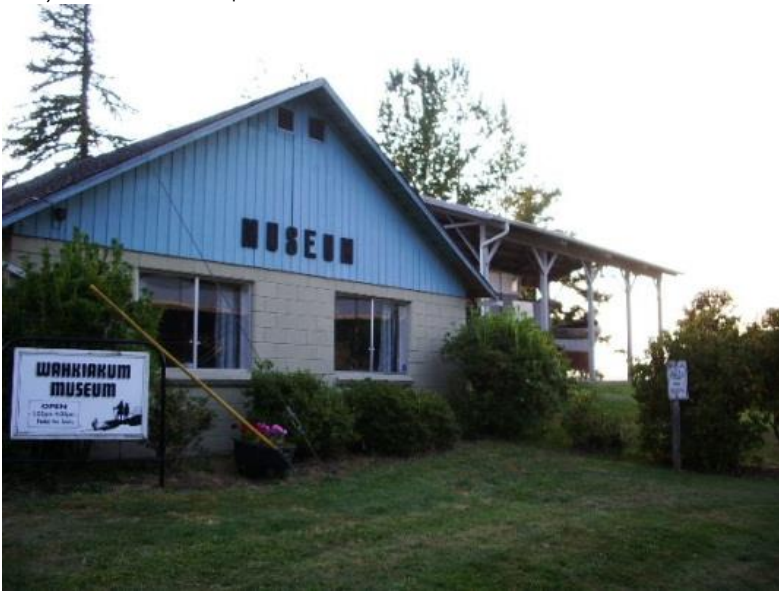
Wahkiakum County Historical Society Museum

Museum featuring early day Wahkiakum farming, logging and fishing artifacts. Gift shop. Memberships available. Call for days and times. Admission: $3.00 for adults, Children are free, and Seniors $1.50.