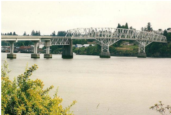
Bridge over the Columbia to Puget Island from Cathlamet