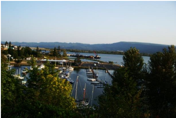
Elochoman slough marina

Camping : Full hookups, dry camping for tents and RV's. Restrooms and showers. Closed Sundays year round.